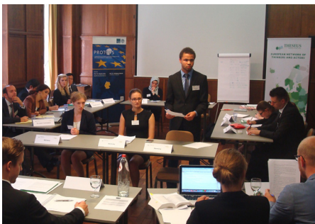
The moot court was the summer school highlight for many THESEUS summer school participants.