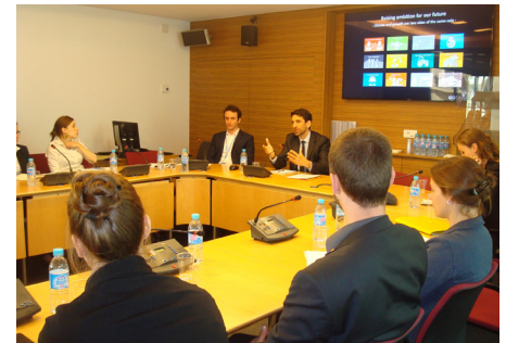
The participants in discussions with energy and climate experts and during their visit of the Parliament (below).

The Europe@Work Seminar 2015 was closed with a roundtable discus-